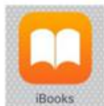
iBooks touch icon

Download the user guide from within the iBooks app (it's more direct this way). By storing the user guide (PDF) within iBooks it will be available for offline viewing (you will not need to download it again from the Internet each time you want to use it).